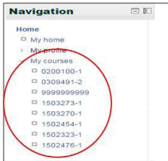
Figure 2: The courses on the navigation menu are displayed by their numbers and not by their names

Ease of use, speed and internal search function: The results showed that Group one of the students identified four common usability problems related to this category; three of them were identified on the two interfaces of Moodle while one of them was identified only on the mobile/tablet interface of Moodle, as shown in Table 3. Only one of the four identified usability problems related to this area is a general problem in Moodle LMS. This is that it is not easy to submit an assignment. The other three usability problems related to this area are specific to the interfaces of the local instance of Moodle LMS that was used by the university where the study took place. The Likert scores obtained from Group two of the students confirmed two out of the four identified usability problems. These related to: