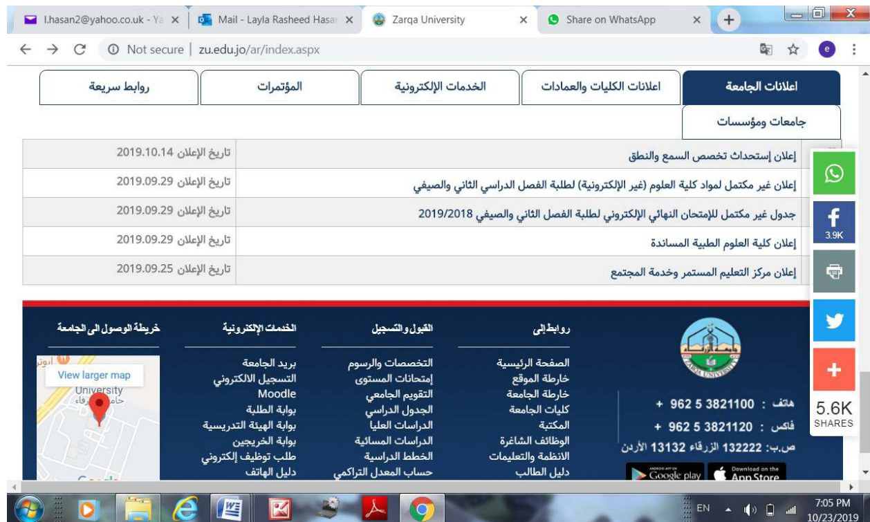
Figure 1: The home page of Zarqa University where the Moodle link is located at the bottom of the page in a small font size.

The location of the login links on the home page of Moodle was not obvious: one was located at the top of the home page of Moodle but it was written using a small font size; the other was located in the middle of the page instead of at the top.